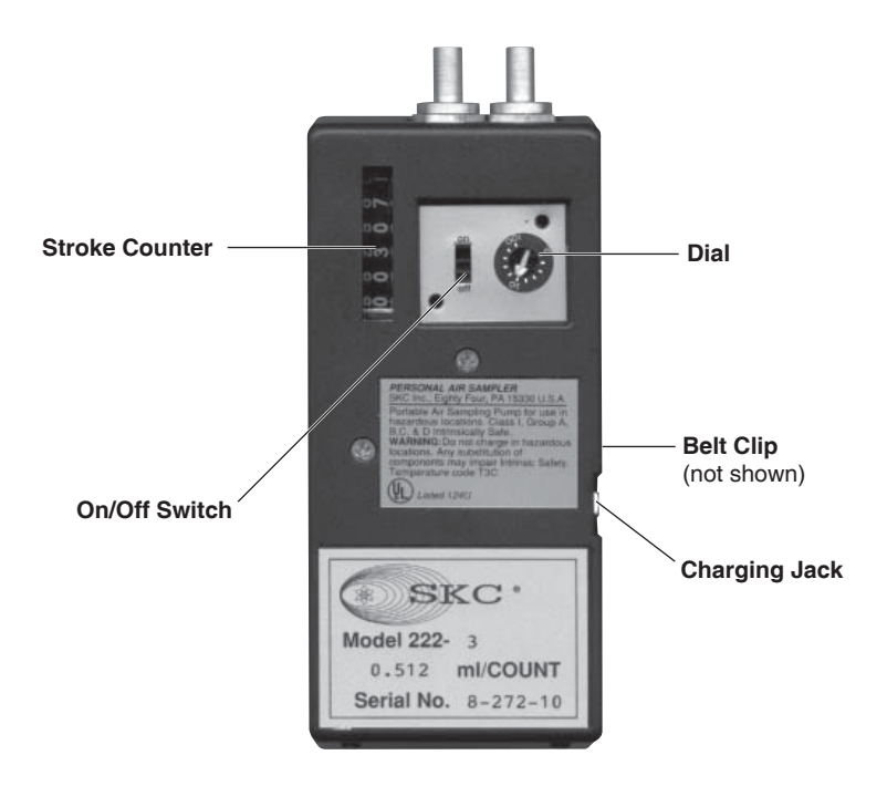
222-3 Low Flow Pump

SKC 222 Series Low Flow Pumps are miniature diaphragm-type pumps for personal or area sampling of gases and vapors in air using sorbent tubes or sample bags. These reliable lightweight pumps are motor-operated and powered by a rechargeable battery pack. Featuring reliable stroke counter technology, the pump's stroke counter indicates the number of times the pump's diaphragm has pulsed (or stroked) during the sampling period. By multiplying this stroke number by the volume of air per stroke, an accurate determination of air volume can be made. SKC sample pumps have special patented valves that close positively, ensuring zero leaks. All working parts are housed in a sturdy, shock-resistant case with belt clip. Model 222-3 pumps provide flows from 50 to 200 ml/min; Model 222-4 pumps provide flows from 20 to 80 ml/min.